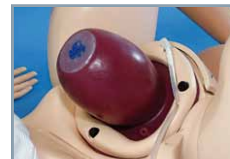
Different uterus modules includes PPH, atonic uterus and retained placenta