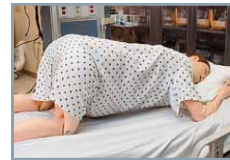
Multiple birthing positions can be performed