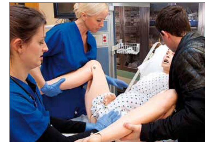
The father or a family member is a natural participant in the delivery room, and can easily play the role of the trainer and maneuver the birthing baby