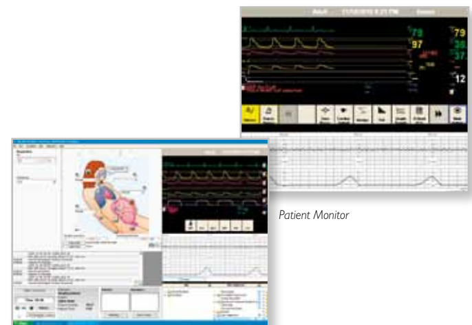
Graphic User Interface

SimMom can be used as a hybrid trainer or as a full-body simulator . In addition, it can be used for nonobstetric training as well as a pregnant female simulator.