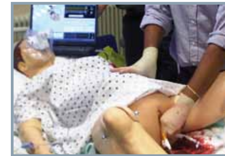
The bleeding scenario can be combined with maternal physiology (e.g., hypovolemic shock)