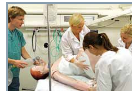
Managing difficult airway during complex delivery