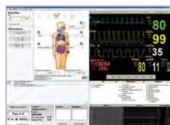
SimJunior Graphic User Interface