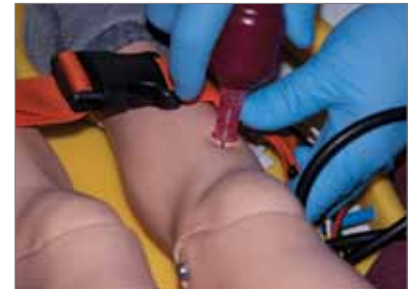
Tibial IO Insertion