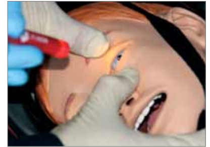
Interchangeable pupils simulate different levels of consciousness