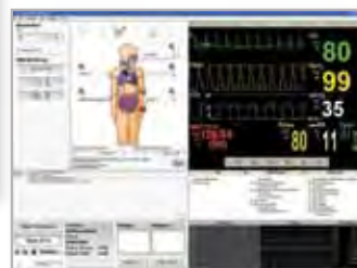
SimJunior Graphic User Interface