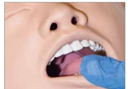
Automatic tongue oedema