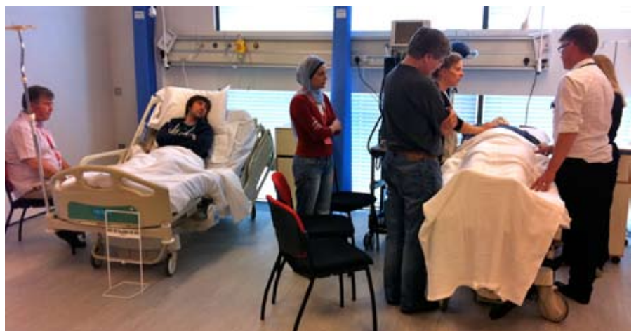
Students undertaking PG Cert in Medical Simulation working with actors from the Harry Partnership.

Within the Faculty of Health and Social Science and Postgraduate Medical School we work with learners at all stages of their career pathways. This spans pre and post registration courses in nursing, midwifery and ODP as well as masters level courses in medical and dental education for senior clinicians from all healthcare professions who wish to develop expertise in the design, delivery and evaluation of education and training in their own professional fields and contexts. Successful bids for capital funding