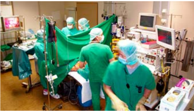
Tübingen Centre for patient safety and simulation (TüPASS)

Risk Assessment and Risk Management systems are becoming increasingly integrated into hospitals in Germany as part of the on-going effort to improve patient safety, a recent survey has revealed... And simulation has an important role to play.