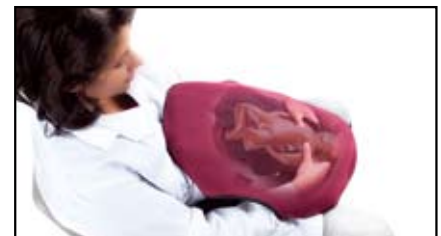
The simulator is strapped onto the instructor

MamaNatalie comes with NeoNatalie newborn simulator in either dark or light complexion.